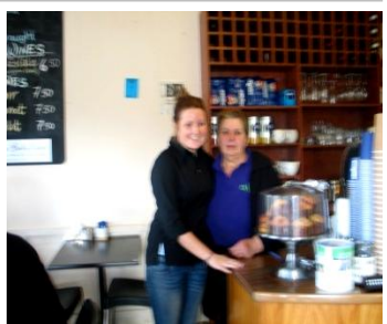
Madison at Chive's Café, Black Rock